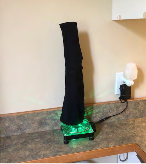
Drying Daytime Garment