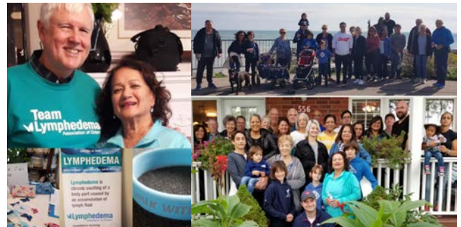
2019 "WALK WITH DEE", PICKERING

Some people are born with lymphedema; while others develop it after their lymphatic system has been damaged by trauma, injury, burns, or most commonly, treatment for some cancers. There is no cure for lymphedema at this time. It is a lifelong condition. When diagnosed and treated early, however, you can manage it and prevent